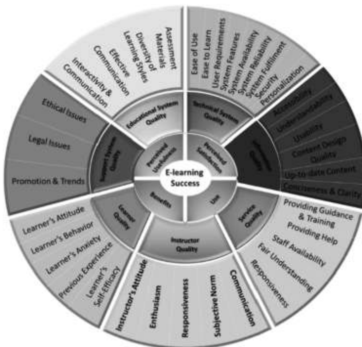
Figure 1: Multidimensional Conceptual Model for Evaluating E-learning System Success (EESS model).

adopts Multidimensional Conceptual Model for Evaluating E-learning System Success (Al-Fraihat et al.,2020) as the model comprised with greater explanatory power, and focus on variety of technical, human and social factors to evaluate the success of such systems. Further, the researchers recommended to extend their investigation to the universities in developing countries by testing their model. According the present study followed Multidimensional Conceptual Model for Evaluating E-learning System Success (Al-Fraihat et al.,2020) as depicted in figure 1.